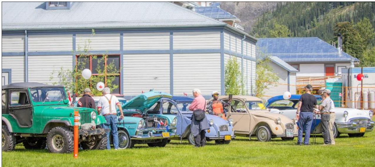
The club lineup in Dawson.