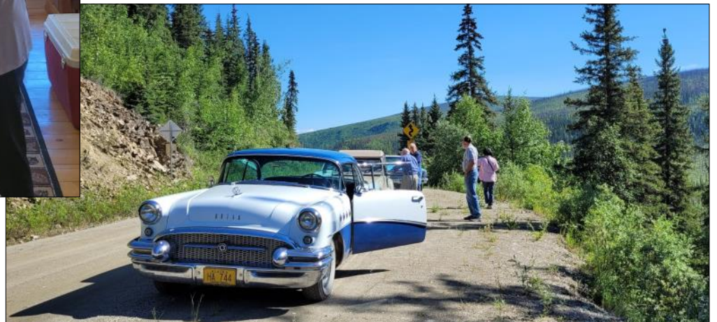
On the Taylor Hwy outside of Eagle and headed back to Fairbanks.