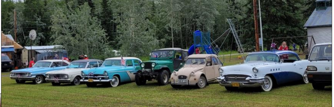
Post-parade parking by the old Eagle schoolhouse.