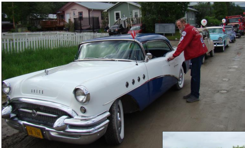
Queueing up for the Canada Day parade in Dawson