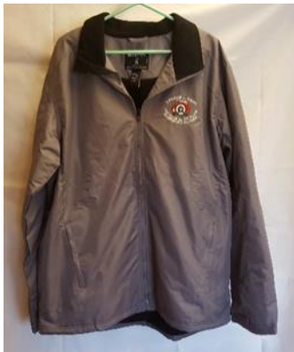
Jacket gray with black collar