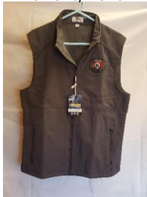
Gray vests- women's/men's