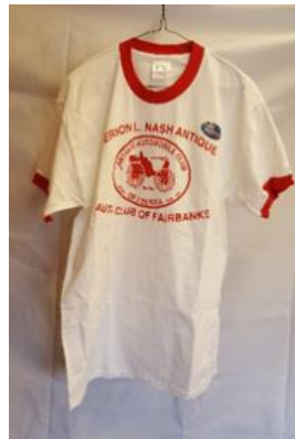
Tee white with red collar