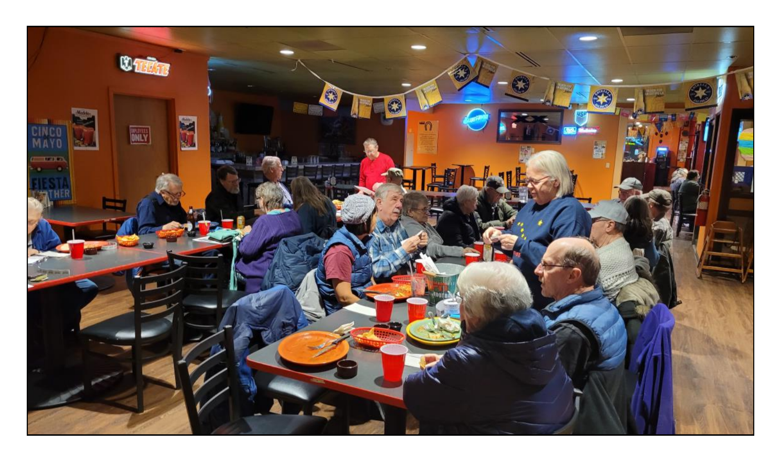
Enjoying a good meal at the November membership meeting, held at the Mayan Palace / Taco Azteca on Airport Way in the Washington Plaza.