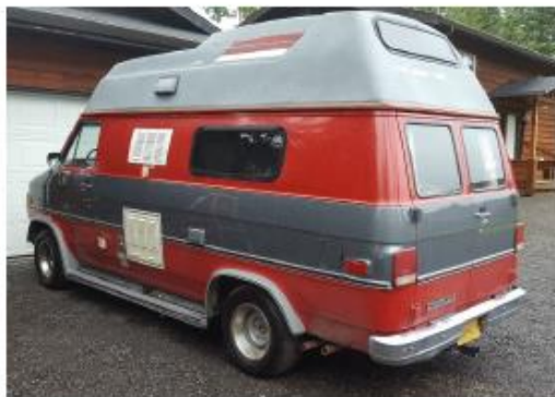
Fall of 2022.