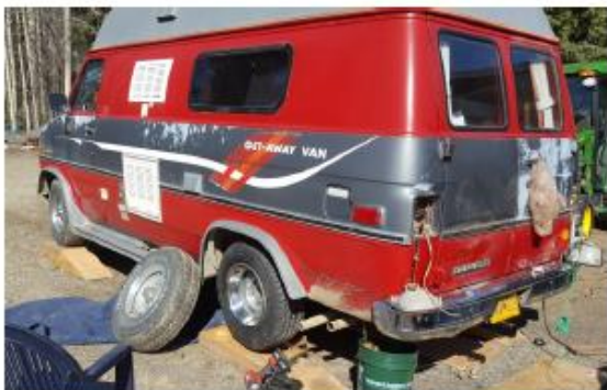
Spring of 2021.