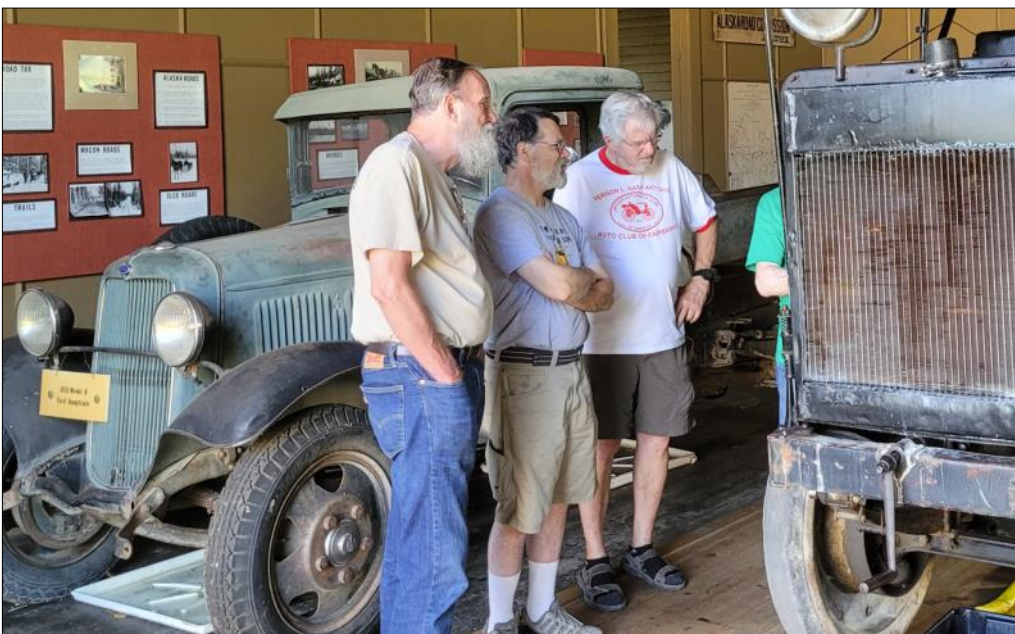
Inspecting the 1916 Jeffery in the Eagle museum on the 2023 ADBT.

For a list of suggested accommodations, please contact sgrundy55ply@gmail.com or call 907-322-9283. This tour is proving to be popular; only a few rooms remain available in all locations. I strongly suggest you reserve your rooms NOW before they're all booked. You can easily cancel your reservations later. Please join this fun and camaraderie-building event!