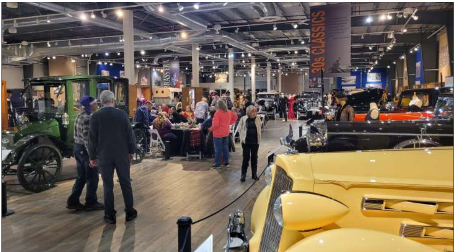
Early birds had plenty of time to mingle and admire the museum's collection before we got down to business.