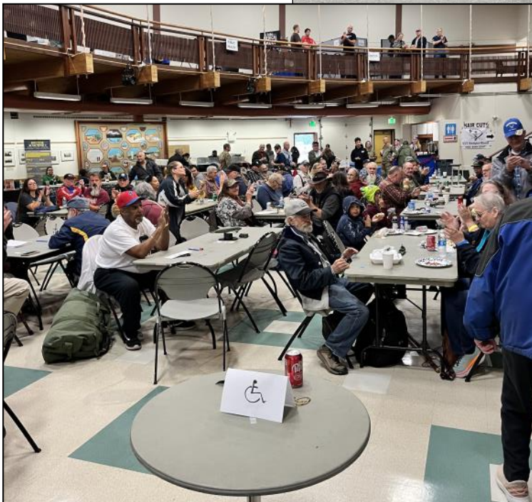
Club members attended the 2023 Veterans Stand Down, held August 19 in Pioneer Park.