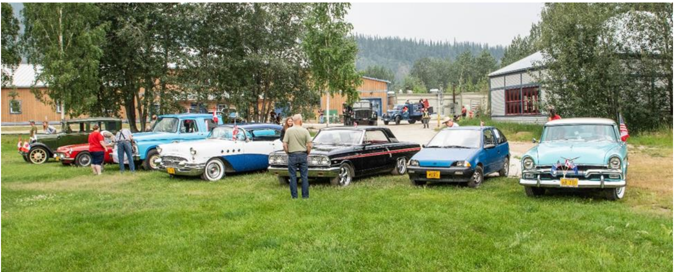
Photo is of the Canada Day club car show in Dawson City in 2019