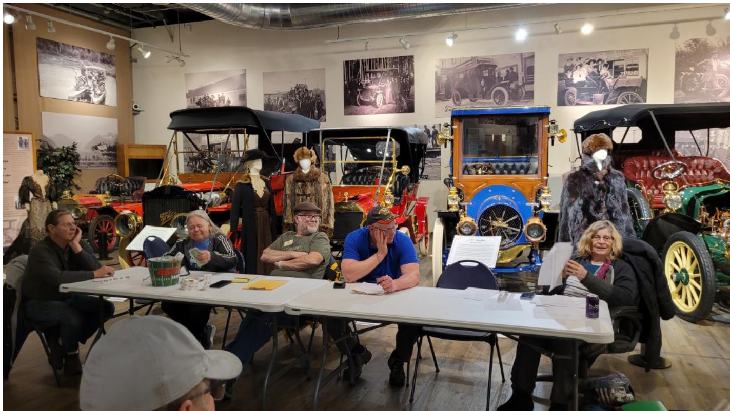
The March membership meeting was held in the Fountainhead Museum on 3/09.