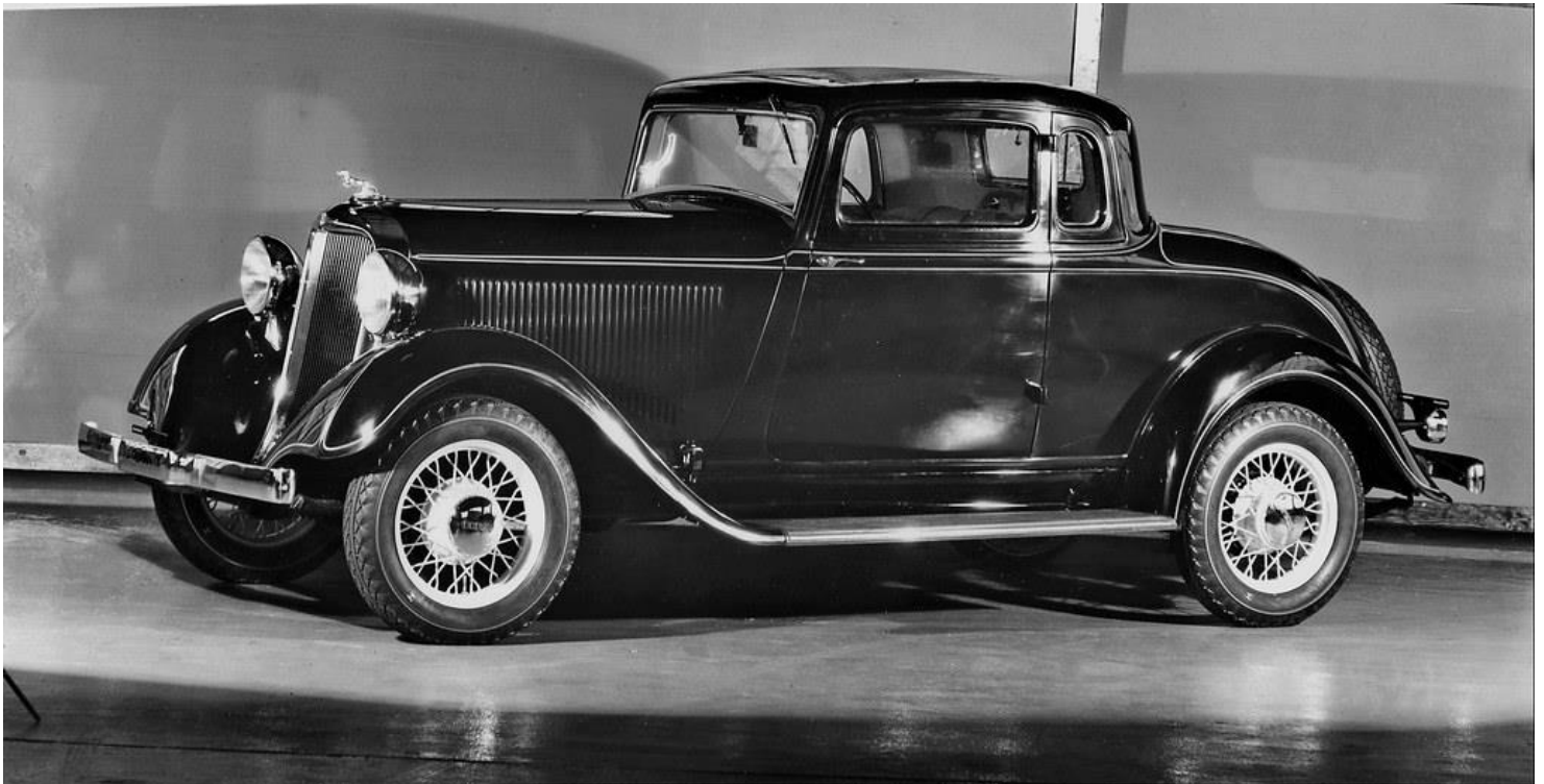
An original factory photo of a 1933 Dodge Coupe.