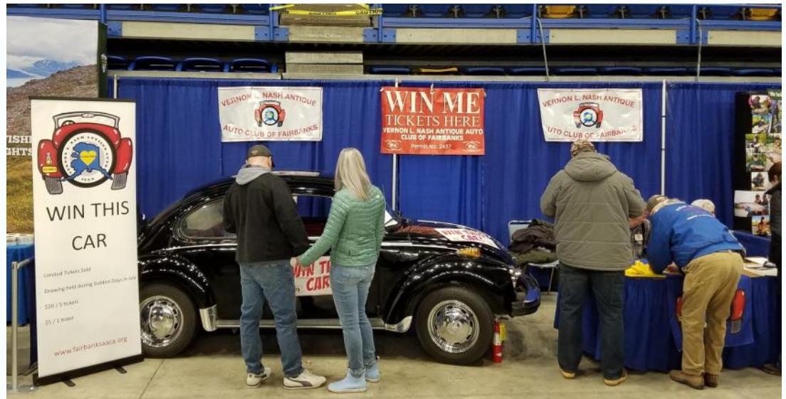
Our raffle car display at the Outdoor Show in the Carlson Center in April.