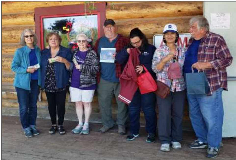
Poker Run winners, showing off their goodies.