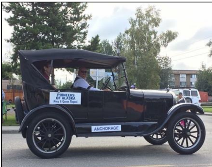
Vernon's 1926 Model T Touring Car