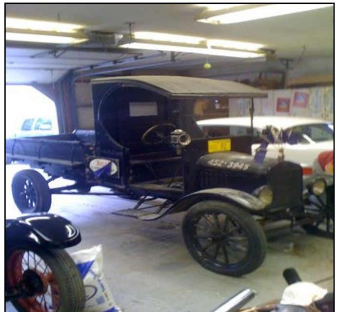
Vernon's 1915 Ford Model T Dump Truck