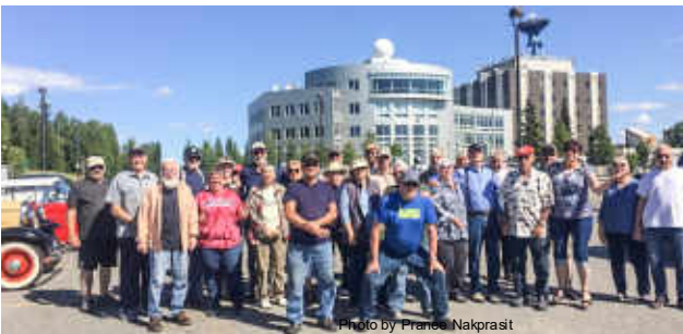
Participants gather at University Hill

The third card drawing found us at the Vallata Restaurant parking lot enjoying good fellowship and many guessing where we were headed for