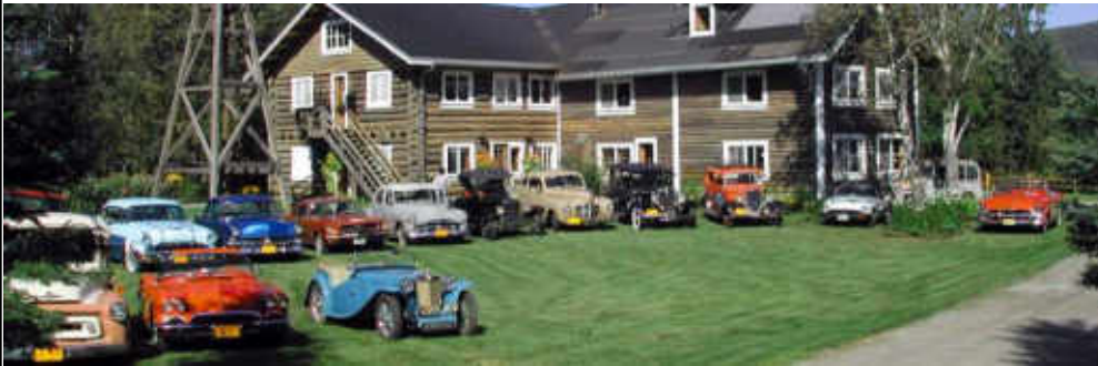
Rika's Roadhouse, 2007 Joint Meet with Anchorage Auto Musers