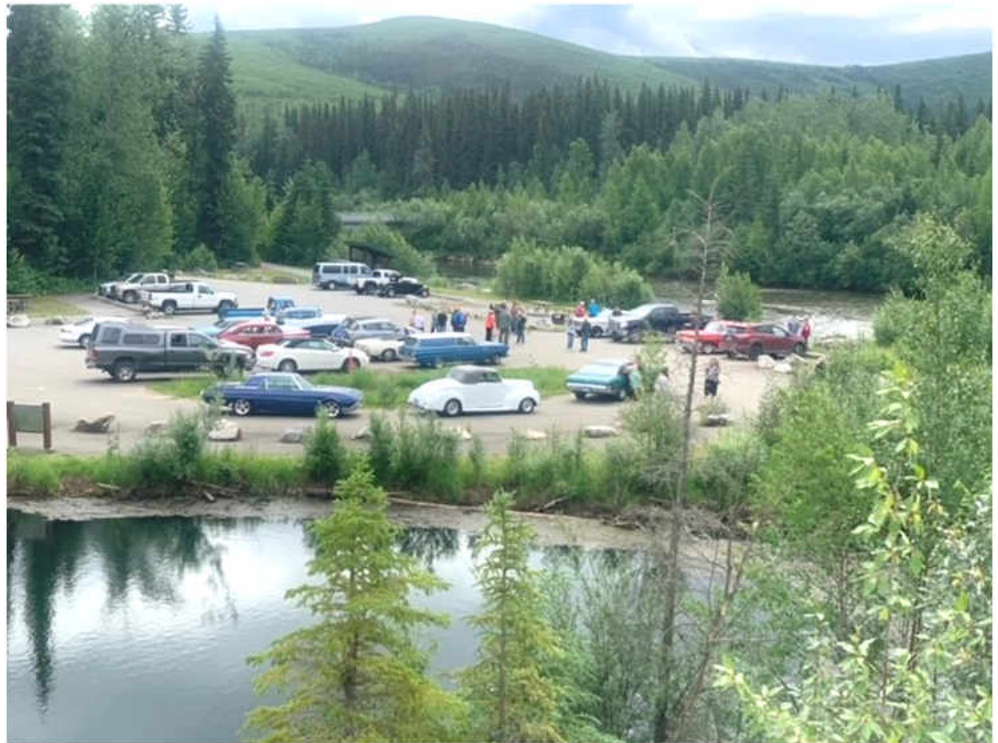
The group at Granite Tors Parking