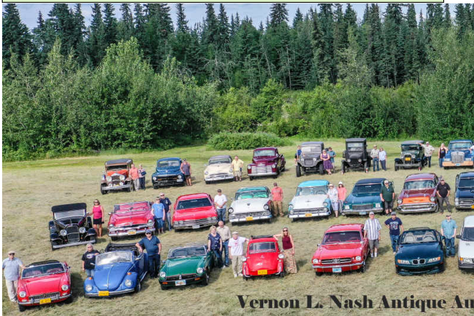
Club Photo July 17, 2021 field behind the Carlson Center, Fairbanks, Alaska (key on next page)

I admit I smell like a skunk. I, too, use my nose.