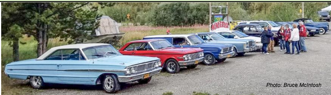
Top photo: Cars parked at the Mondo. Lower photo: Dining indoors