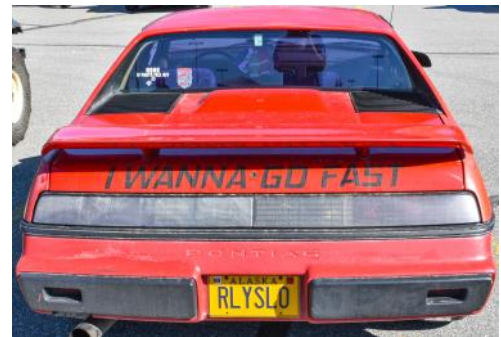
Seen at the June 5th car show

The Board Meeting is Tuesday, July 6th at WILMA'S OFFICE . Meeting starts at 6:30 PM; no food. Board Meetings are open to members.