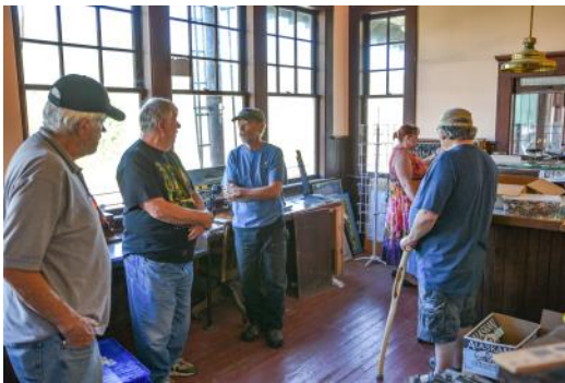
In the Depot Clerk's Office

After our June 13, 2021 poker run and meal at the Monderosa Restaurant in Nenana, some of the car club event participants opted to visit the historic Alaska Railroad depot located in downtown Nenana and then to check out the tree farm at Woodland Farms just north on the Parks Highway.