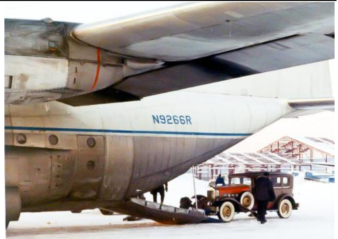
The 66B in the belly of the Herc, and being unloaded here in Fairbanks in February, 1972

ry, parading in Golden Days and earning the Spectator's Choice award in 1972 at a Vern Nash Antique Car Club show in the old Penney's parking lot.