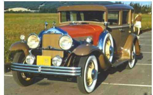
WK 66B at Creamer's Field, 1972

The Board Meeting is Tuesday, May 11th at The Bakery Restaurant . Meeting starts at 6:30 PM; please dine at the Bakery before. Board Meetings are open to members.