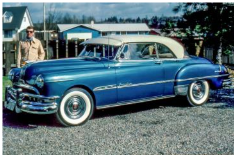
1951 Pontiac Chieftain Deluxe in 1976