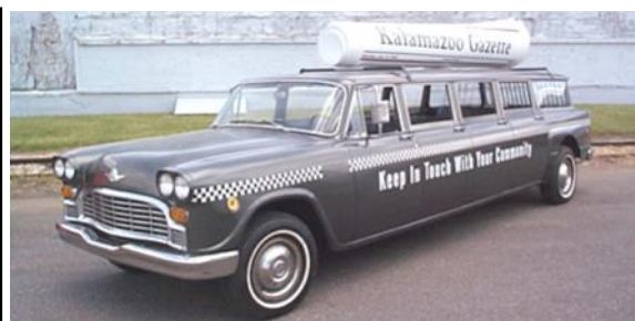
Early-70's Checker Aerobus as owned and used by the local newspaper in Kalamazoo, Michigan

The Board Meetings are Tuesday, March 9th and Tuesday, April 6th - both via ZOOM . Meeting starts at 6:30 PM. Board Meetings are open to members.