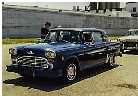
The Larrick Checker, above at a car show at the Gilmore Museum, and below at the Checker factory lot.