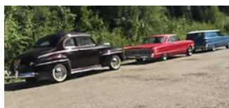
Above: card draw stop Right: CHS Picnic Area