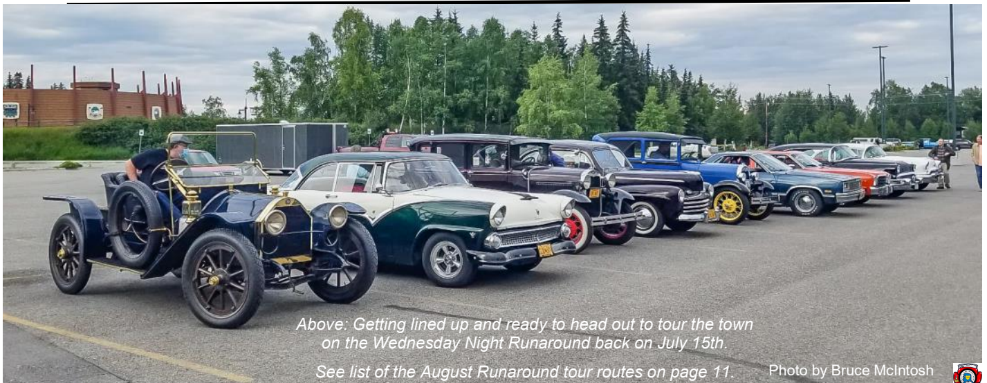
Above: Getting lined up and ready to head out to tour the town on the Wednesday Night Runaround back on July 15th.

See list of the August Runaround tour routes on page 11.