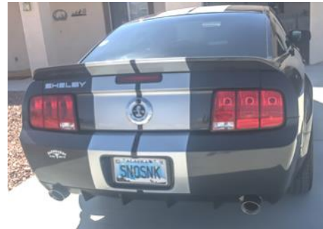
Dan Portwine sent this photo (note the license plate) that he saw in AZ.

Both Meetings subject to cancelation based on COVID-19 restrictions