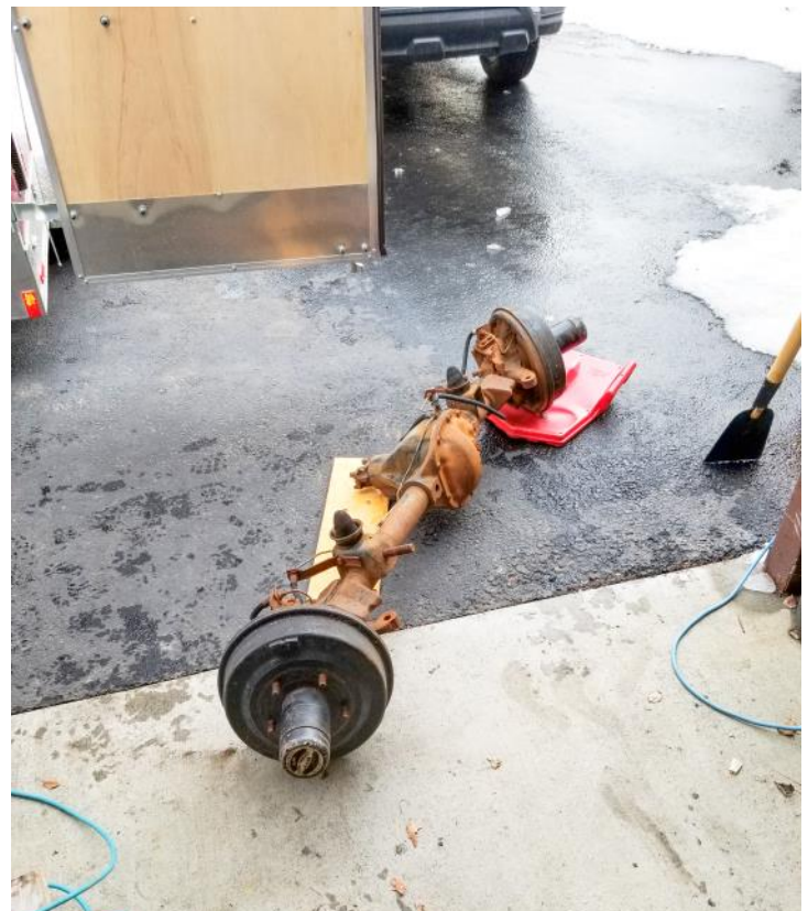
Carl Westphal says that "social distancing is hard on my back! - I stole a kids sled to slide the axle into the garage from the trailer."