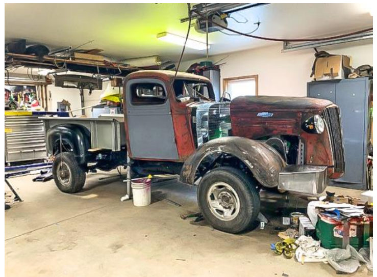
Jim Gibertoni has been spending lots of time isolated in his garage - see more details in the article on page 8.