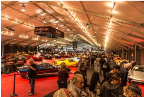
The Barrett-Jackson auction is a real circus - even in the first hours of the opening day 1/11, above.