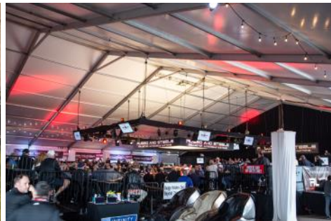
The big tent at Russo & Steele