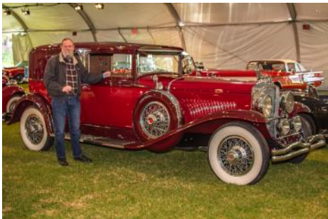
One of my personal favorites at the Worldwide Auction. (1930 Dusenberg)