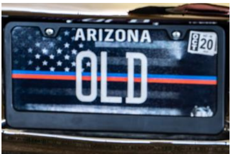
My favorite Arizona license plate speaks volumes...