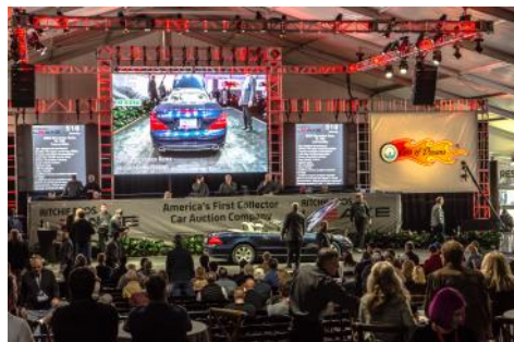
The big tent at the Leake Auction