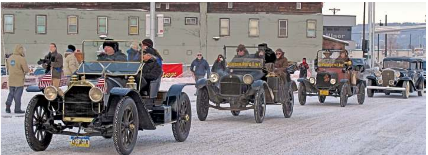
The Chalmers - Detroit leads the opening of the new Veterans Memorial Bridge (Barnette Street) in November, 2012