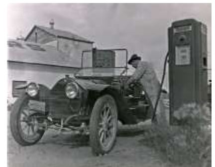
Charlie Creamer fuels the car at the dairy