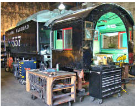
Work progresses on No. 557 in Wasilla