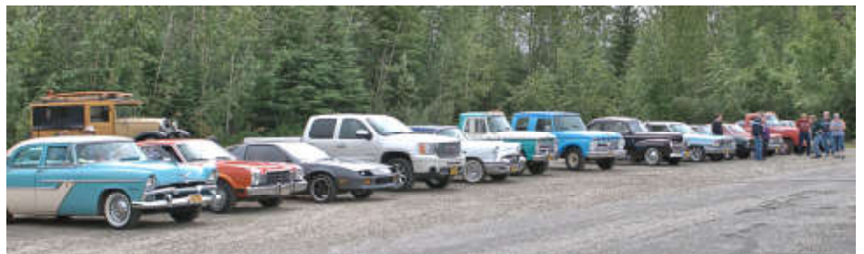
Cars at Bathing Beauty Lake pull-out near Moose Creek on the trip down to Delta