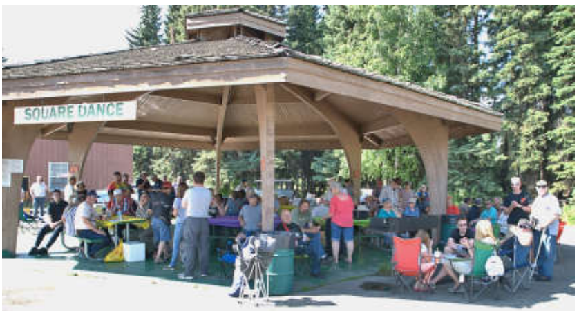
Membership gathers at the picnic shelter in Pioneer Park before the Raffle Car Drawing and picnic lunch.