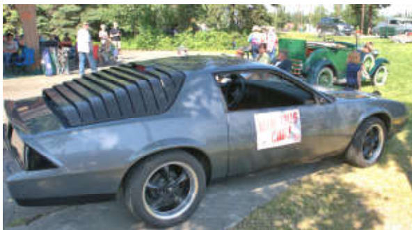
Raffle Car waiting for its new owner...