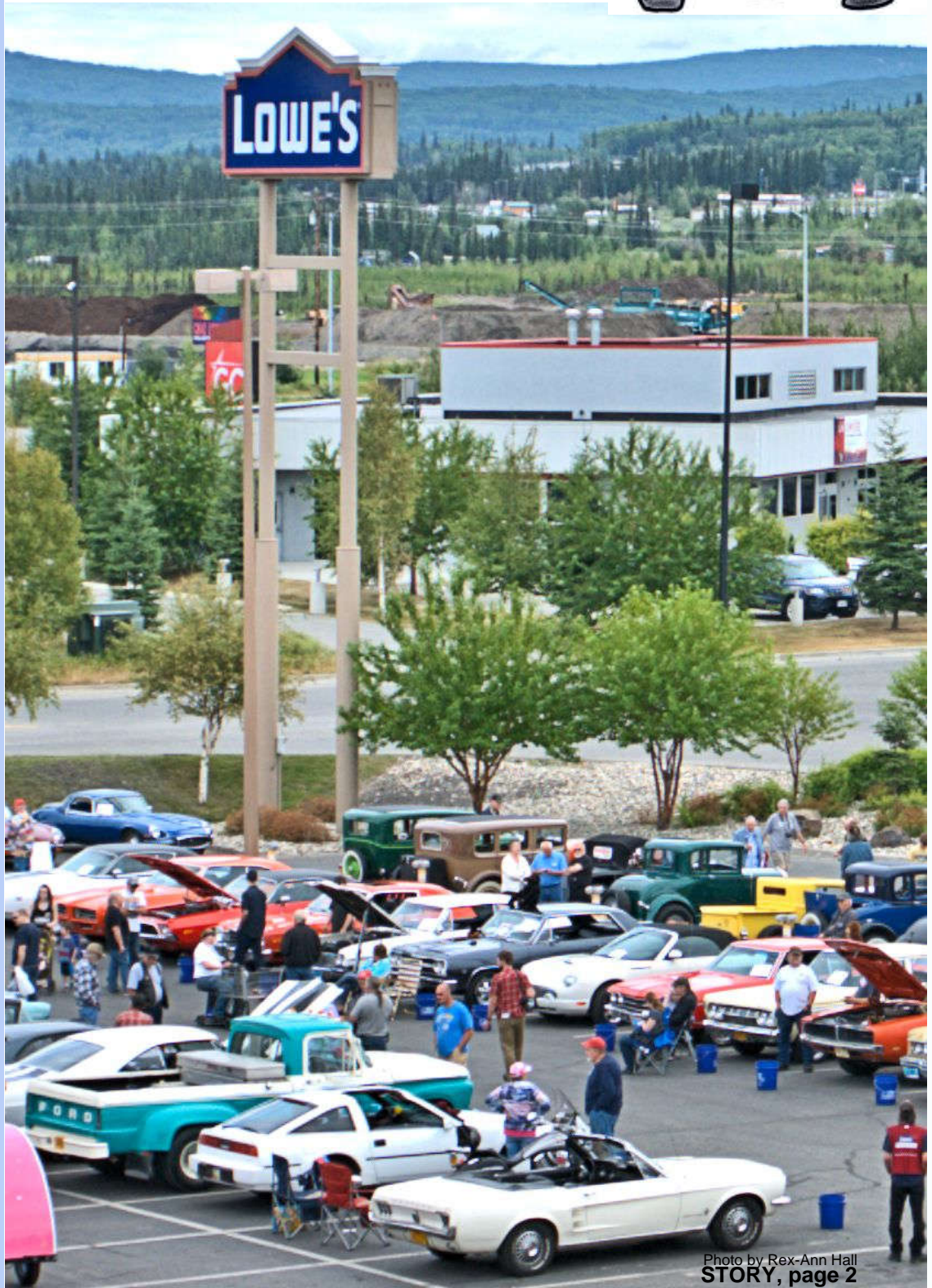
STORY, page 2