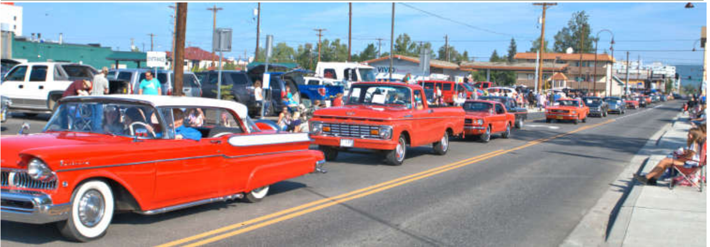
ABOVE: Cars parade up Noble Street in the annual Golden Days Parade