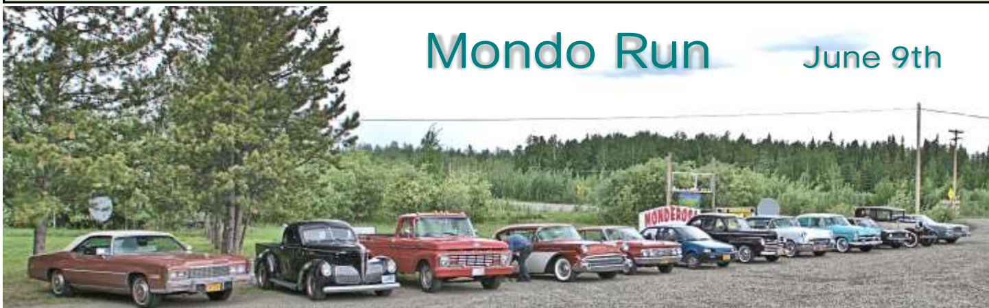
Above: Cars line up at the Monderosa. Below: at one of the poker card draw stops along the way.