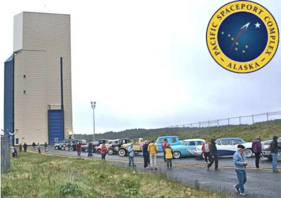
Cars arrive at Launch Silo #1 inside the Kodiak Pacific Spaceport Complex - Alaska