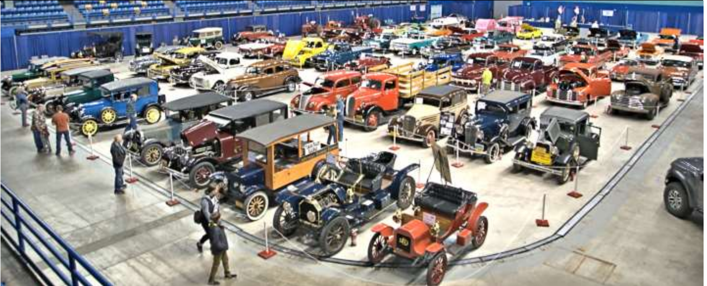
The indoor show field from the mezzanine.

Remember Acme from the Roadrunner cartoons? A lot like Amazon today.