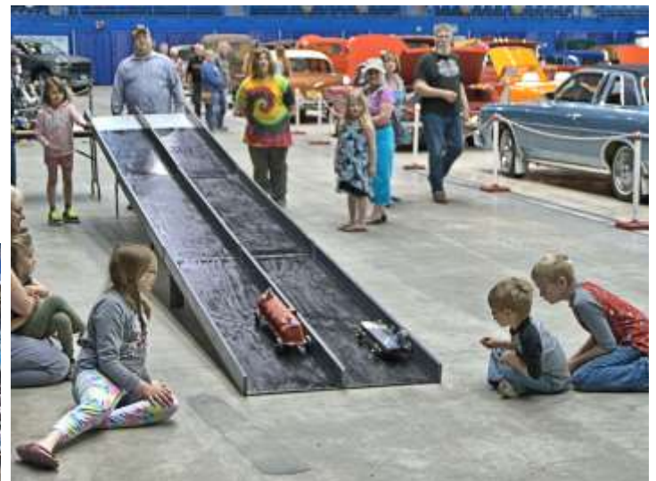
Valve Cover Races were again a hit with the kids at the show.