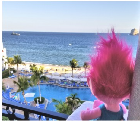
Poppy looks over the pool to the ocean.

appointed timeshare resort with around 120 all ocean and pool view rooms facing the Sea of Cortez side of the tip of the Baja peninsula. As you can see from the pictures, the view of the sunrises and the rock formations on the peninsula are breathtaking, with the added benefit of the best beach in Cabo (Medanno Beach) right off