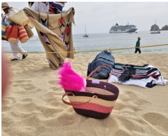
Poppy and the beach vendors.

appointed timeshare resort with around 120 all ocean and pool view rooms facing the Sea of Cortez side of the tip of the Baja peninsula. As you can see from the pictures, the view of the sunrises and the rock formations on the peninsula are breathtaking, with the added benefit of the best beach in Cabo (Medanno Beach) right off