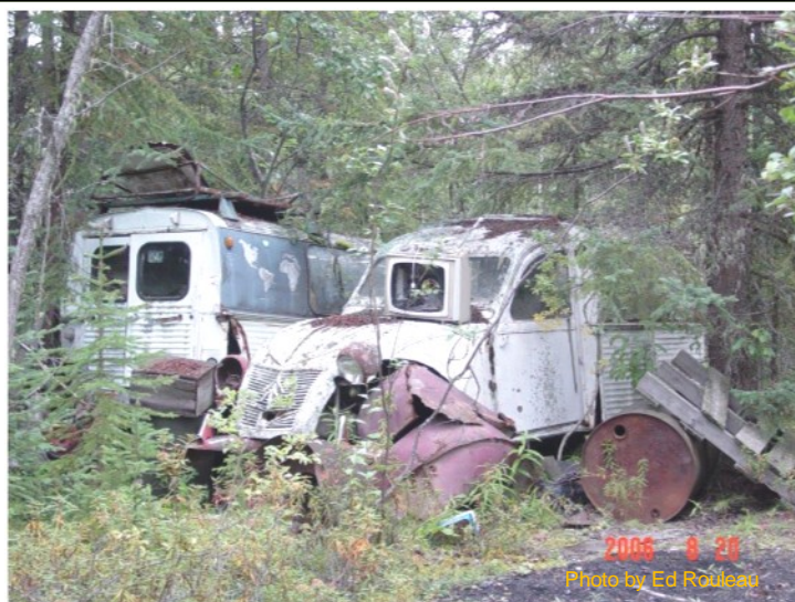
Deux Citroën dans les Bois

There is a red line painted on the map that traces the route they took, which started in Lausanne, Switzerland, headed through Spain, across the Strait of Gibraltar and then to Algiers turning south across the Sahara Desert, down the east coast of southern Africa and into South Africa. After a series of side excursions, they apparently went by ship from Cape Town to the western hemisphere and landed in Montevideo, Uruguay and then headed north to Brazil up to Rio, then back south through Argentina to the tip of Ushuaia, capitol of Terra del Fuego, Argentina. From