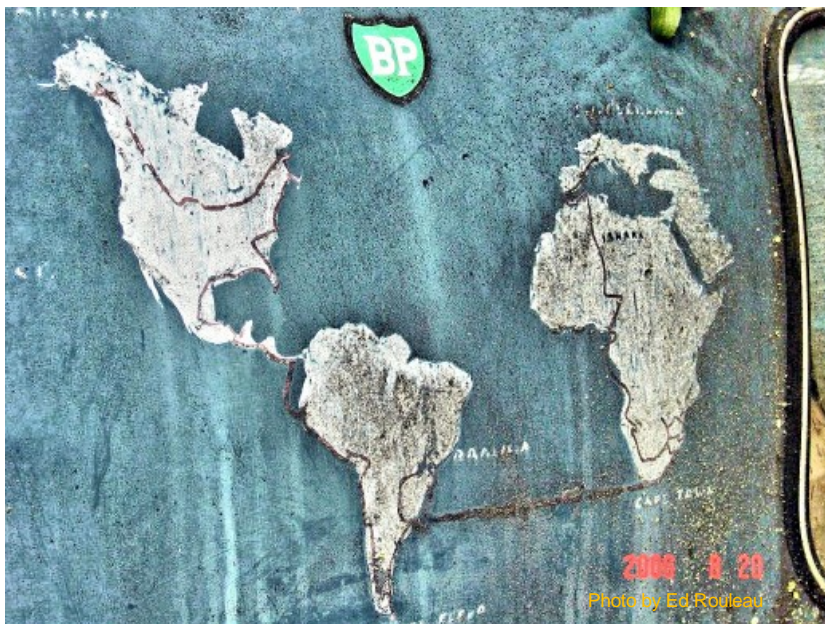
Map painted on the side of one of the Citroën 2CV-AKL1s

There is much more to learn, and my investigation will continue. Look for Part 2 in March. Meanwhile, if anyone in the Club has any knowledge or information about these two world traveling Citroëns, I would greatly appreciate hearing from you!