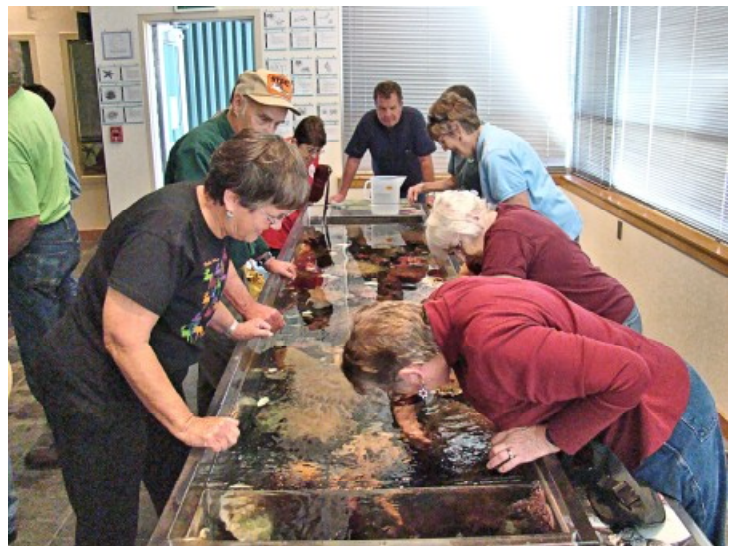
Members on the last Kodiak tour play in the museum touch pool.

The 2018 ferry schedule was just announced so there's plenty of berth and cargo space available. But space can quickly fill to capacity mainly with commercial vehicles now, and later with private (tourist) vehicles. So, it's essential to reserve space on the ferry NOW for you and your vehicle. You can always cancel later