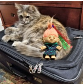
Me and Tinkerbell both wanted to go on the trip!