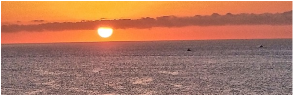
Sunrise view from the room in Cabo

The Creamers trip was planned to be quite "low-key" due to Christols recent