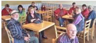
Group indoors at CarsNCoffee at Great Harvest Bread Company at the Bentley Mall.

Another rainy weekend day on June 17th still brought out a good crowd for the drive out to Chena Hot Springs Resort for a picnic. The group left CarsNCoffee at 10am and made the 60 mile drive in a drizzly rain. There were nine cars and 17 people. The folks at CHS Resort were great, and re-arranged things so that we could