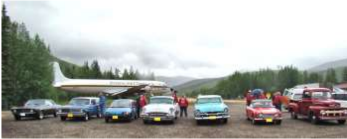
Member cars at the end of the runway at the Chena Hot Springs Resort

Another rainy weekend day on June 17th still brought out a good crowd for the drive out to Chena Hot Springs Resort for a picnic. The group left CarsNCoffee at 10am and made the 60 mile drive in a drizzly rain. There were nine cars and 17 people. The folks at CHS Resort were great, and re-arranged things so that we could