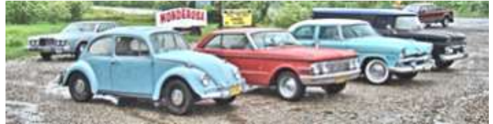
Member cars parked at the Monderosa , near Nenana, AK