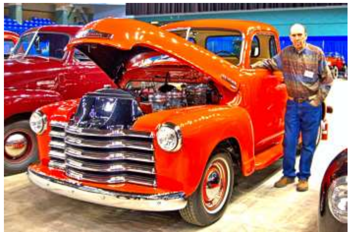
BEST TRUCK: Jim Gower stands with his 1949 Chevrolet 3100 Pick-up.