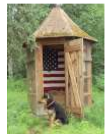
Willy on bear watch at the outhouse door