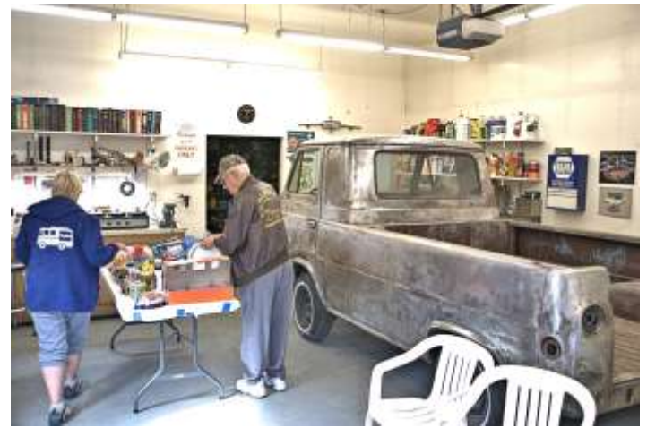
Latest Ford project in the main garage