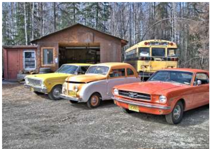
Part of Greg's high horsepower stable