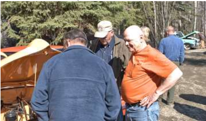
Group looks for the engine in the Crosley