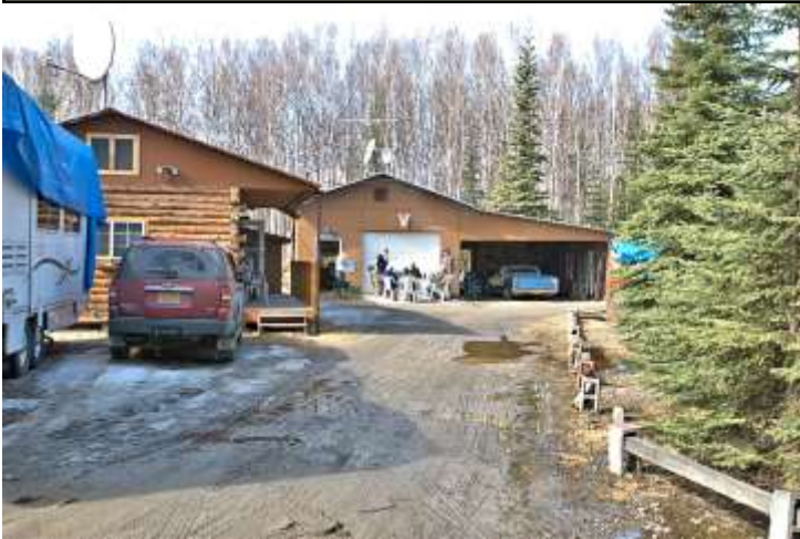
Driveway to the Oslund homestead

Why is stuff sent on ships called "cargo" and UPS sends "shipments?"