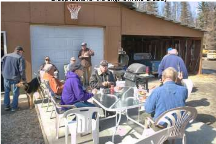
Outdoor dining in the Alaska spring sunshine!