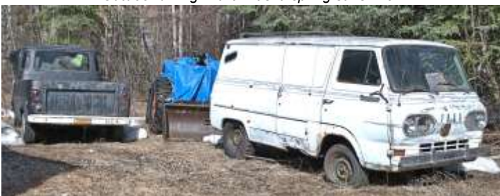
Spares for the Econoline project