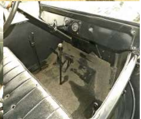
Above (counterclockwise): The '23 T Roadster, its interior, and its engine.