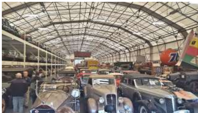
The largest building at Marymount - note the shelves

After my tour of the LeMay Family Collection, I drove on to Tacoma and the