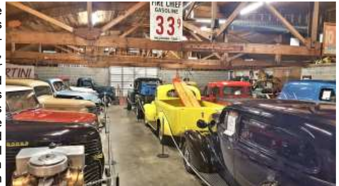
Light Trucks in the Rifle Range at the Academy

There are over 500 volunteers who work at the museum and on restoring and maintaining cars. When Harold was alive, he did no serious restoration work, buying cars in generally good condition and storing them in a protected environment. Now the staff completes one or more restorations each year. Several of the rooms in the Academy are open to browse at your leisure, but the larger storage buildings must be toured with a docent guide. The tour was great, and our guide was very well informed, able to answer the many questions about individual vehicles. All the cars have window placards with identification and many details.