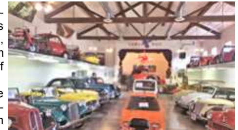
Small cars in the Auditorium at Marymount