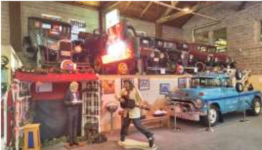
Cars in the Gym Bleachers at Marymount

continues to be held there. Marymount is still owned by the LeMay family and is the permanent home of the Lemay Family Collection, and the family controlled board continues to add to the collection.