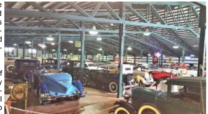
One of two large buildings at the LeMay Family Museum

After my tour of the LeMay Family Collection, I drove on to Tacoma and the