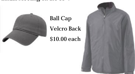
Ball Cap Velcro Back $10.00 each