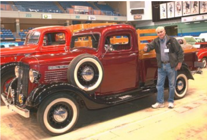
Best Vintage Ron Dane 1936 GMC T-4 Pickup