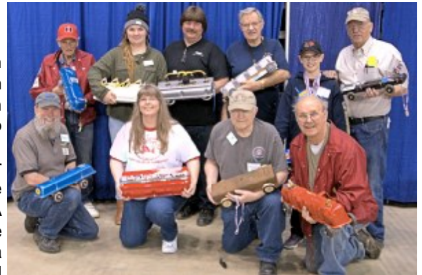
Valve Cover Race Participants