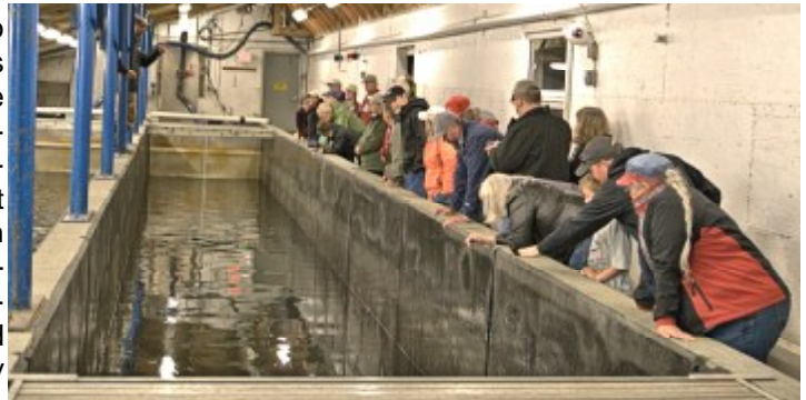
Watching Coho fry on the Hatchery Tour