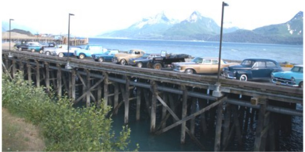
Club cars lined up on the Kelsey Plaza Dock on Friday evening.