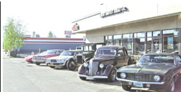
Cars 'N Coffee May 14, 2016

The Board Meeting is Monday, June 6th — at Sam's Sourdough. Meeting starts at 6:30pm, with dinner before. Board Meetings are open to members.