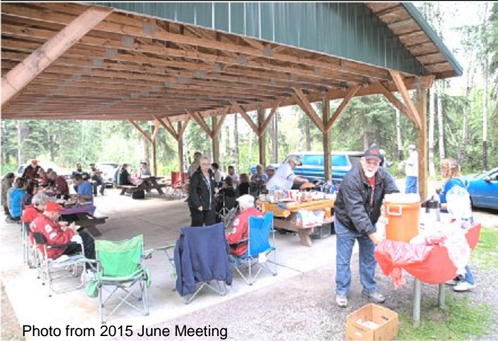
Photo from 2015 June Meeting

The cost of living hasn't affected its popularity.