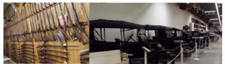
Just one wall at the Dixie Gun Works

The next surprise was at Dixie Gun Works in Union City, Tennessee . This is a mail order business for antique Civil War black powder guns, parts, gun kits, uniforms, books etc. Little did we know they also had a car collection and museum. We spent most of the day there.