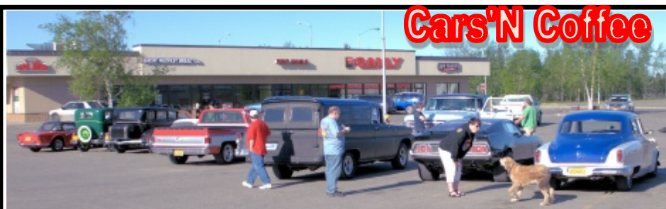
The first CarsNCoffee of 2015 wasn't until nearly a month later than our start this year!