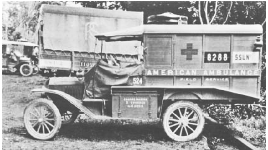
WW1 Model T Ambulance—see poem

* "Voitures" is the French word for automobiles; "blesses" were wounded soldiers; "essence" for gasoline; and "l'eau" for water.