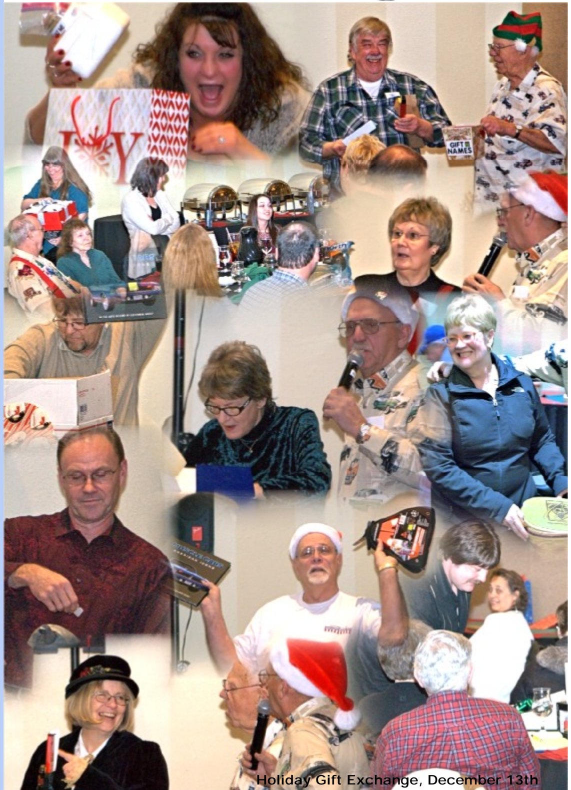
Holiday Gift Exchange, December 13th

Antique auto news from Alaska's largest car club and most northern region of AACA