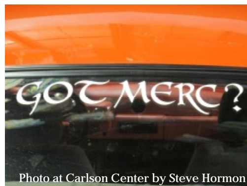
Photo at Carlson Center

The Board Meeting is MONDAY, Jan 11th — at Sam's Sourdough . Meeting starts at 6:30pm, with dinner before. Board Meetings are open to members.