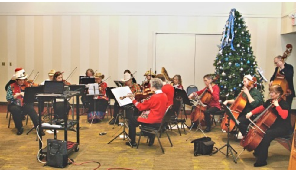
The Arctic Strings Orchestra once again delighted the group by providing music during the social hour which happened before the banquet, meeting and gift exchange.