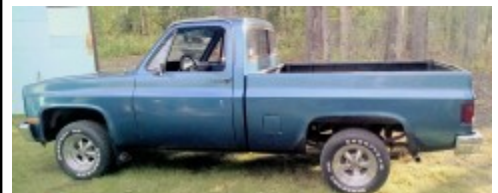
Raffle Vehicle for 2016: '81 Chevy C-10 Shortbed