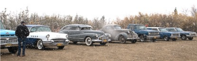
Bub Larson looks at the snow accumulating on the line of cars on one side of the parking lot at Cleary Summit.