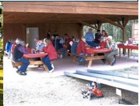
Above left: cars at Pioneer Park on Friday / Right: Good food at the Picnic that evening

Another fun-filled Alaska Joint Meet was held, hosted by our club. Our club had 17 members participate and a dozen came up from the Auto Musers region in Anchorage. The town of Delta Junction was a great location, and the local hospitality was very welcoming to our group of old cars (and old car nuts). We had a great barbeque on Friday evening, with Delta Meats hamburger and yak Polish sausage on the grill. We then held our challenge Valve Cover Race competition. Despite our previous experience, the VLNAACF was skunked with the AAMA taking the top three+ finishes.