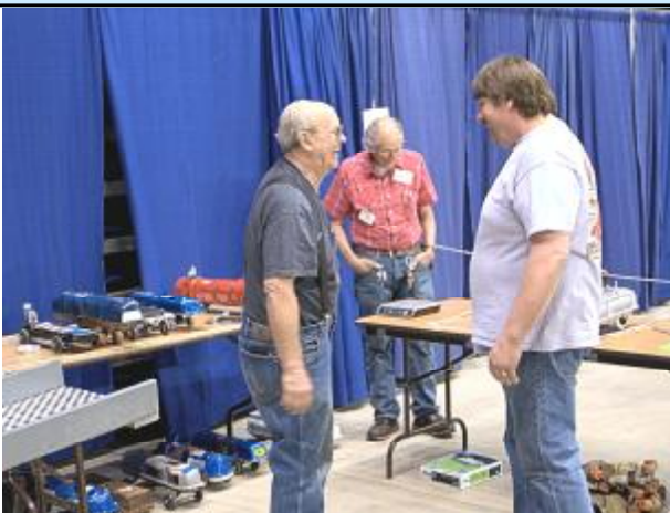
Antique Car Club.