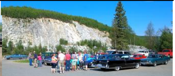
Card draw at the Granite Tors Trailhead parking lot