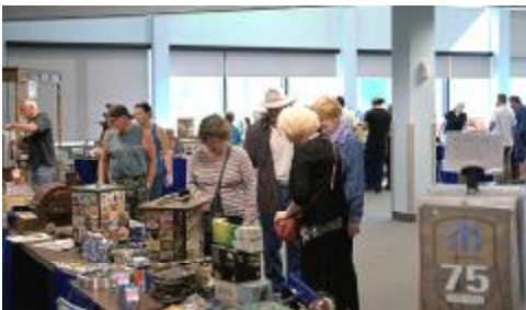
Good traffic at the Swap Meet / Antique Sale

(Ed. Note: Information on the AACA website)