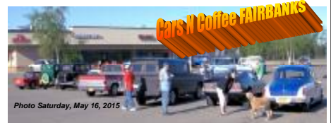
Photo Saturday, May 16, 2015

Bake chocolate cake mix according to package directions. When done, pike holes in cake. Pour Eagle Brand over cake. Pour topping over cake (warm slightly to make it pour easier). Cool cake and spread Cool Whip over the top. Crumble Heath bars and sprinkle over top. Delicious.