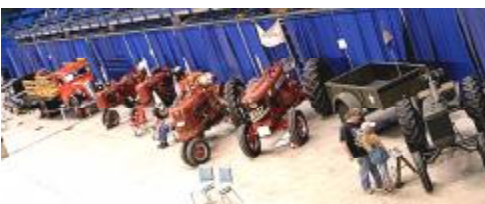
Tractors from the Antique Equipment Club