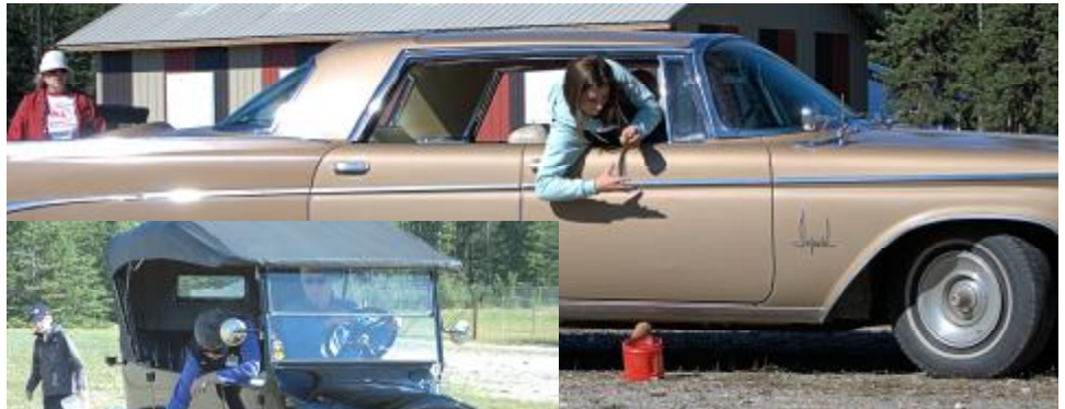
Car games take skill, no matter what the vintage!