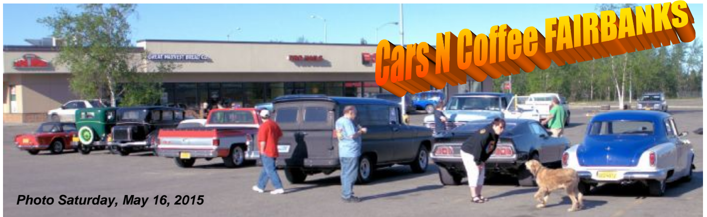
Photo Saturday, May 16, 2015

Tact is the art of making guests feel at home when that's where you wish they were.