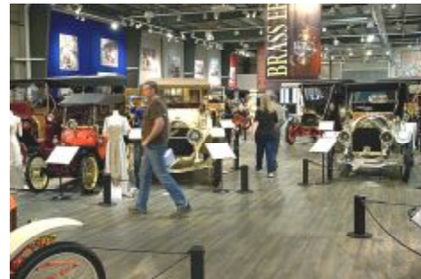
Many members stayed after to tour the museum

you can see (see minutes on pg 6). Many members took advantage of Willy's offer to keep the doors open well after the meeting ended so they could tour the museum and check out the new additions.