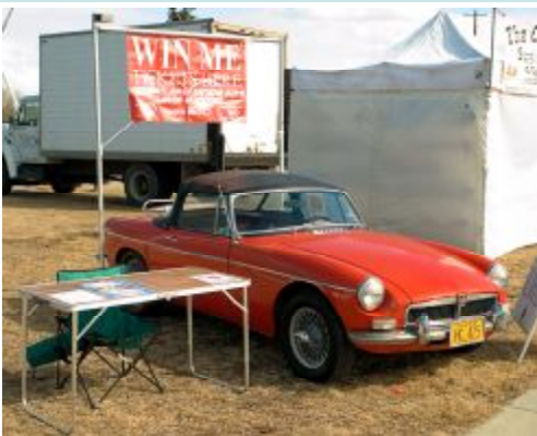
Set up and ready to sell on April 17th