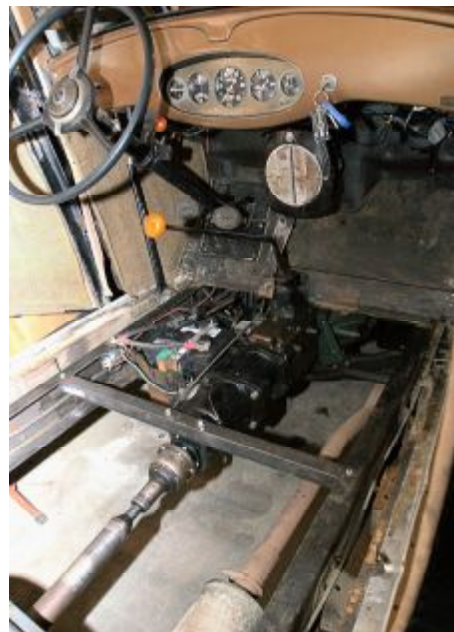
(Continued on page 15)