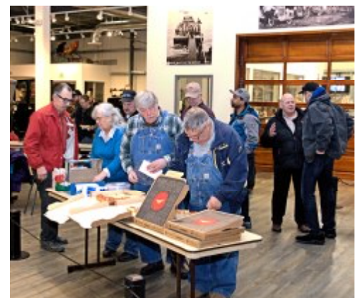
Feeding the Planners helps boost attendance... and gets folks thinking of the summer event mantra “drive and eat.... drive and eat”