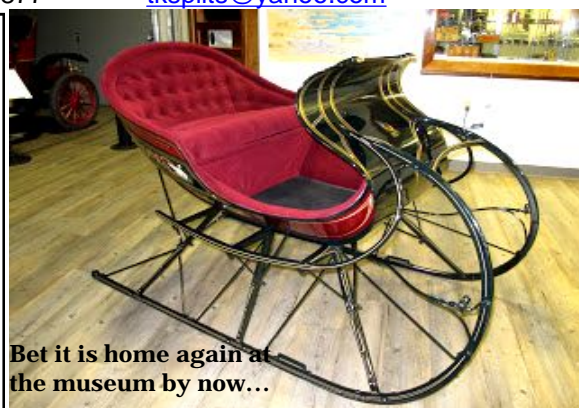
Bet it is home again at the museum by now...

The Board Meeting is Tuesday, January 6th — at Sam's Sourdough . Meeting starts at 6:30pm, with dinner before. Board Meetings are open to members.