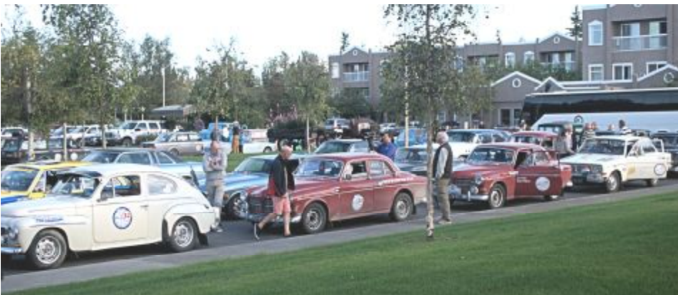
Volvos at Bear Lodge preparing to leave with our club for the Salmon Bake

Anybody who would like to make a similar adventurous trip, our fully prepared and equipped Volvo is now available. Your vacation will be without any problems!