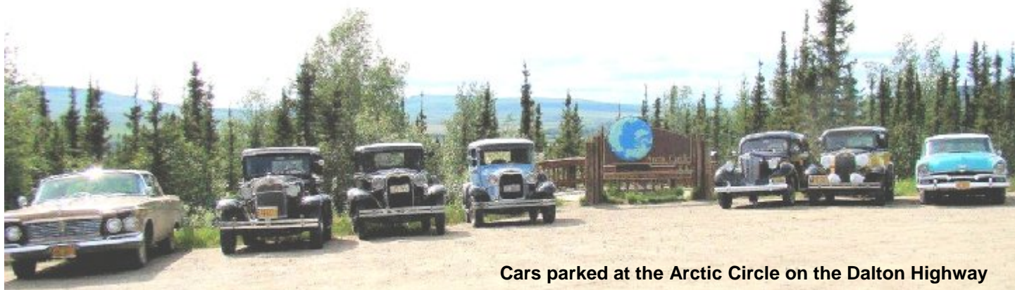
Cars parked at the Arctic Circle on the Dalton Highway