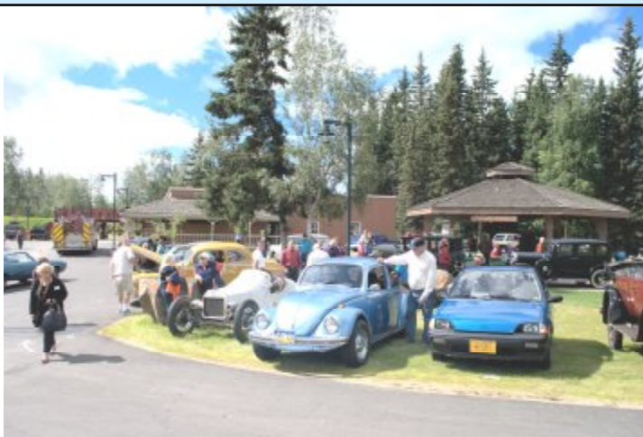
There was a very good club turnout for the BBQ Picnic on Saturday

The picnic and raffle drawing were delayed just a bit, but first order of business was the raffle drawing, and then the Pig Roast Picnic. BBQ was prepared by Midnight Sun Catering this year, and was quite good. Club members brought salads and many delicious desserts.