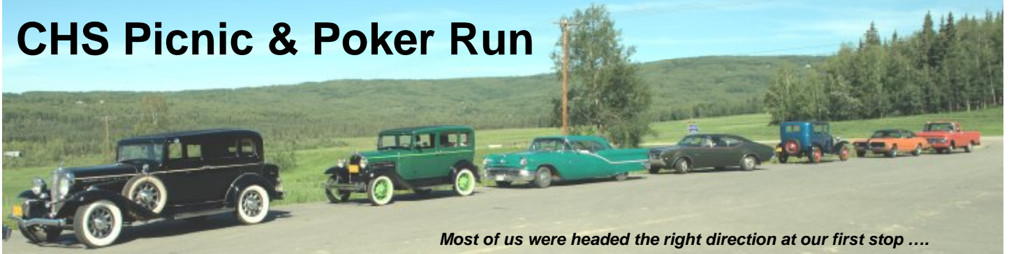
Most of us were headed the right direction at our first stop ....