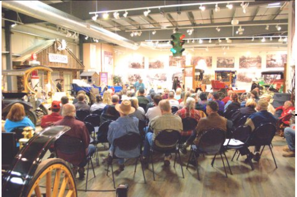
Good Attendance at the May Meeting at the Fountainhead Museum

I see at least several good things about camping with your antique car. It provides an excuse to get out in your car, you see interesting places, spend time with your children or grandchildren, build some good memories for them of the old cars and doing things, and it need not be cost prohibitive. Has anyone else tried it?