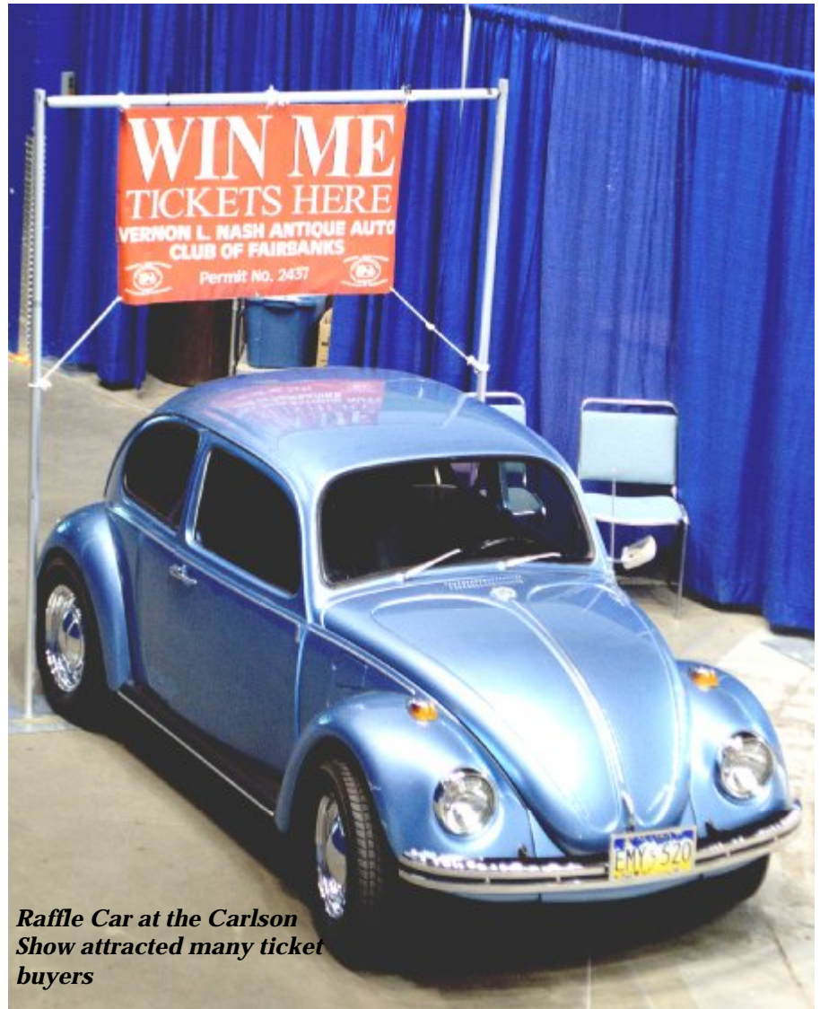
Raffle Car at the Carlson Show attracted many ticket buyers