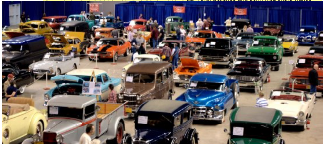
The Carlson Center was full of our cars, and there was a steady crowd on both days of the show.