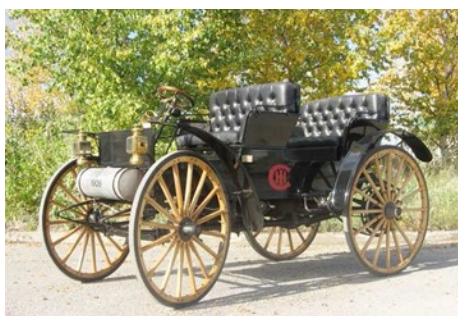
Fountainhead Museum: 1909 International Harvester Highwheeler Model D

In addition to putting up all the steel for the building and getting the wall panels ready to install, our most exciting news is