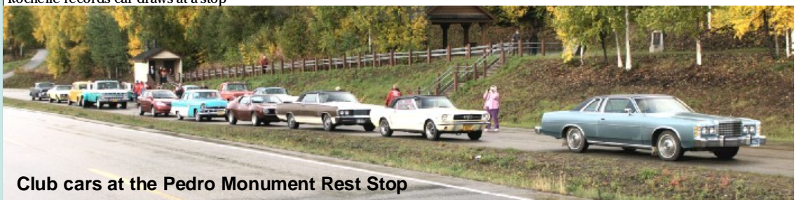
Club cars at the Pedro Monument Rest Stop

It was a great fall day for a drive, and no better way to spend it (other than Moose or Caribou hunting...).