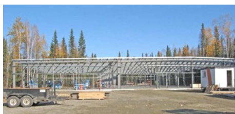
The new Fountainhead Antique Automobile Museum building takes shape

Okay, disregard what I wrote in last month's newsletter about not calling our collection a museum. We've decided to call ourselves a museum after all. We couldn't find a good synonym for museum in the Thesaurus, and there just isn't a better word out there to describe the facility we're building and the collections we've accumulated. "Fountainhead Antique Automobile Museum" is now our official name, although we won't be offended if you shorten it to the Fountainhead Museum, or simply FAAM.