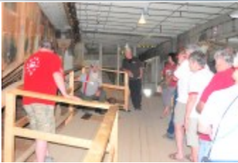
Dredge #4 Tour

On the 3rd, we again cued up for the Yukon Ferry and made the drive back across the Top of the World Highway to the junction with the Taylor Highway for the trip to Eagle. Eagle is the next town downstream from Dawson City on the