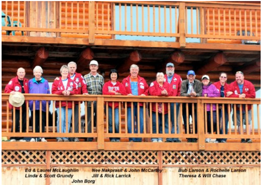
Above: Group near the end of our tour at the Falcon Inn Bed & Breakfast in Eagle.

The group left from the Sadler's lot in Fairbanks early Saturday afternoon, June 29th, and drove down to Tok where we had a great dinner at Fast Eddy's. Sunday morning, the group made the longer, but far more scenic drive to Dawson City. Pavement ends