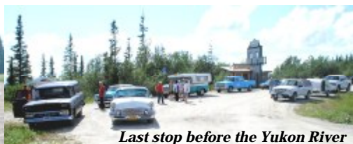
Last stop before the Yukon River

The view was spectacular from the Top of the World, and we soon arrived on the bank of the Yukon to wait for the ferry. Crossing to the other side, we settled in for a few days stay in historic Dawson City. The group found some good restaurants and reasonable prices (for tourist season) in the city, and Dawson and the Canadian Government have done a good job preserving the landmark buildings in this historic town.