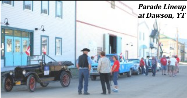
Parade Lineup at Dawson, YT

hosts a Community Pot-Luck Supper each year on July 3rd at the Improved Order of Redmen Hall (interestingly, the order dates back to the Boston Tea Party). The dinner is well attended by community residents and many visitors and former residents who return each year. We met lots of wonderful people, some who we knew from