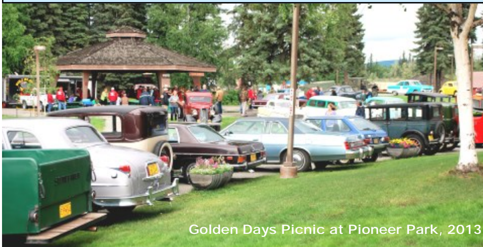
Golden Days Picnic at Pioneer Park, 2013