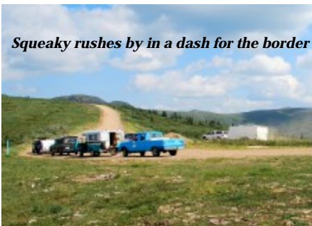
Squeaky rushes by in a dash for the border