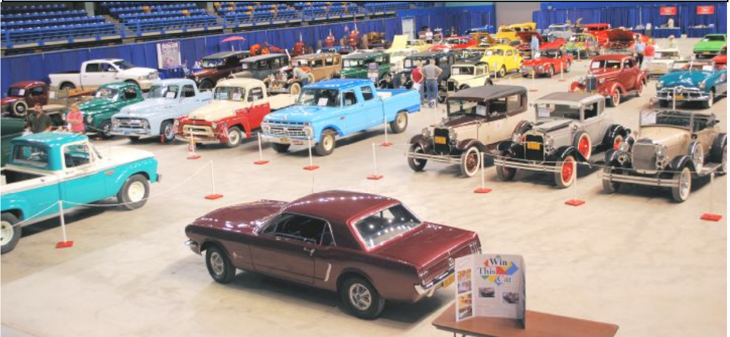
(Continued from page 1) Part of the field: the raffle car Mustang sits in its corner at the Carlson Members Only Car Show on May 25th & 26th

It is easier to get older than it is to get wiser.