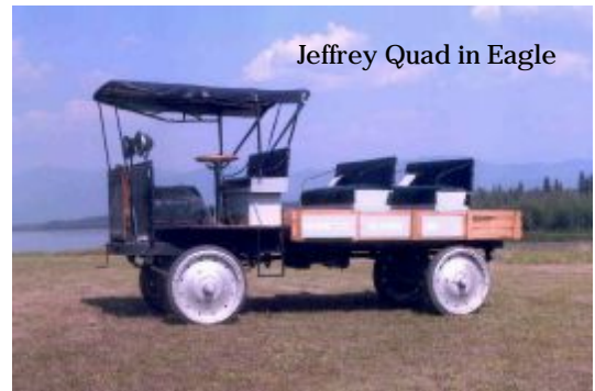
Jeffrey Quad in Eagle

The Board Meeting is at 6:30 PM at Sam's Sourdough Café on the Tuesday before the membership meeting. This month it is on Tuesday June 11th / Dinner is B4. Everyone is also welcome to attend.