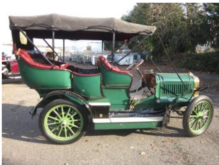
The Fountainhead Museum's new Pope-Toledo, a 1906 Type X11 7-passenger Touring, is identical to the first Fairbanks Car. It is currently being restored.