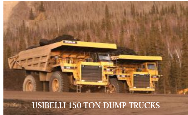
USIBELLI 150 TON DUMP TRUCKS