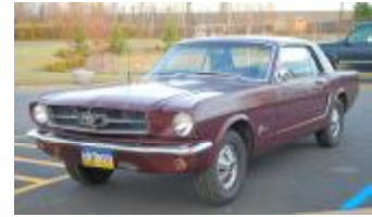
1965 Ford Mustang Raffle Car