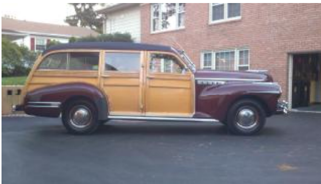
The restored Buick at Truant's in Maryland

Four weeks later, our 41 Buick Wagon arrived safely from Alaska. It was shipped