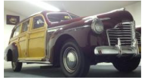
1941 Buick Special Woodie Wagon

The Board Meeting is at 6:30 PM at Sam's Sourdough Café on the Tuesday before the membership meeting. This month it is on Tuesday February 12th / Dinner is B4. Everyone is also welcome to attend.