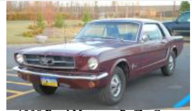
1965 Ford Mustang Raffle Car