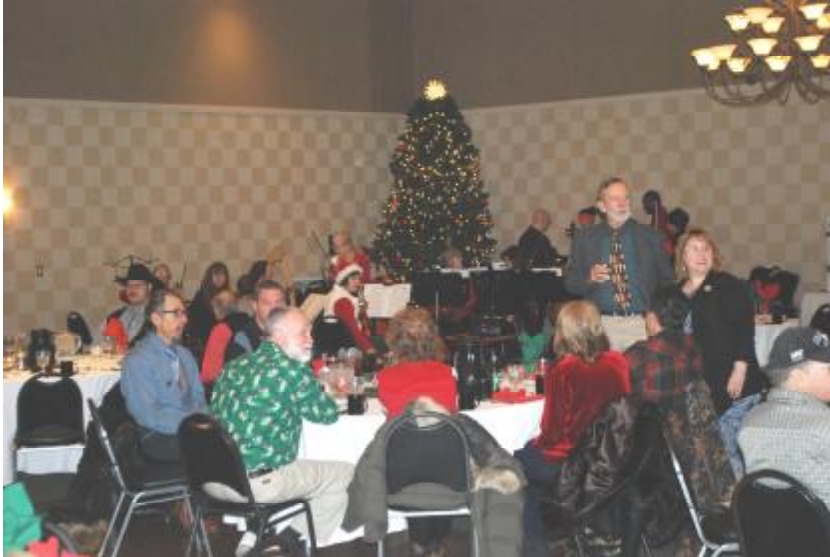
Picture above shows a corner of the large Gold Room at the Westmark, with several tables of club members and with Northern Strings playing music by the tree.