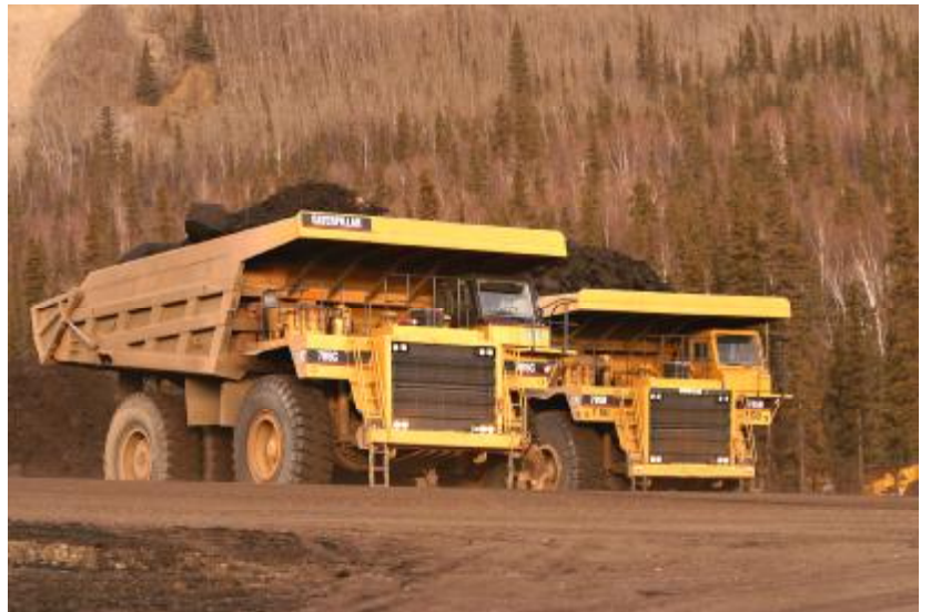
USIBELLI 150 TON DUMP TRUCKS