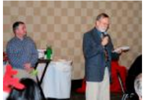
Above: Official stuff was short..