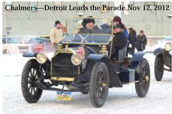
Chalmers—Detroit Leads the Parade Nov 12, 2012

The Board Meeting is at 6:30 PM at Sam's Sourdough café on Tuesday December 11th / Dinner is B4. Everyone is also welcome to attend.