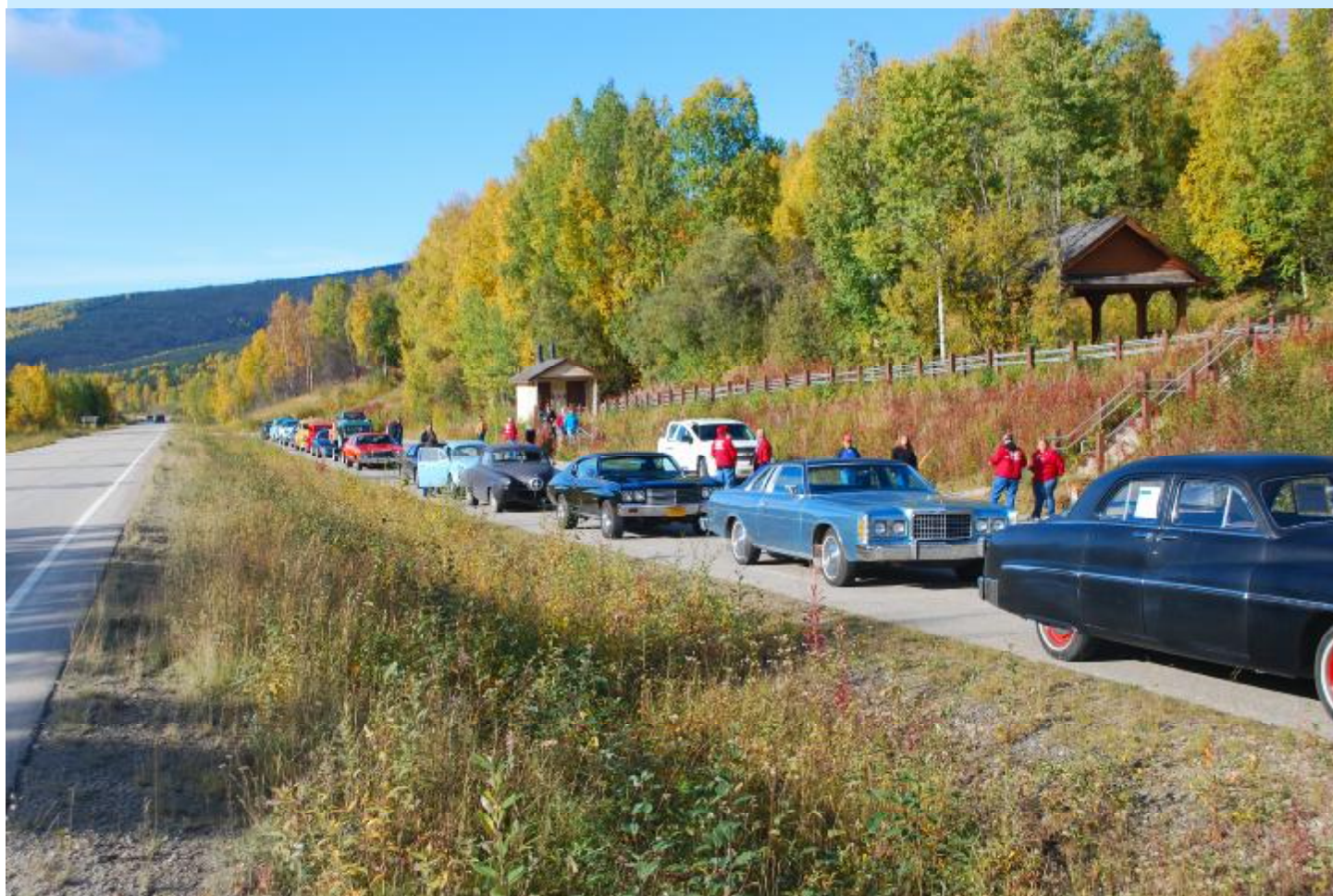
Chatanika Run—Club cars stopped at the 2nd stop (3rd Card Draw) at Pedro Monument

Just when you think you've won the rat race along come faster rats.