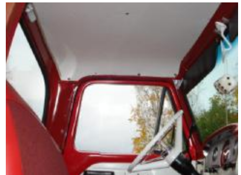
Shower Panel Headliner

mission was in need of an overhaul and the engine ran badly. The floor pans were rusted through as was the driver's side cab column. This model was made with single wall