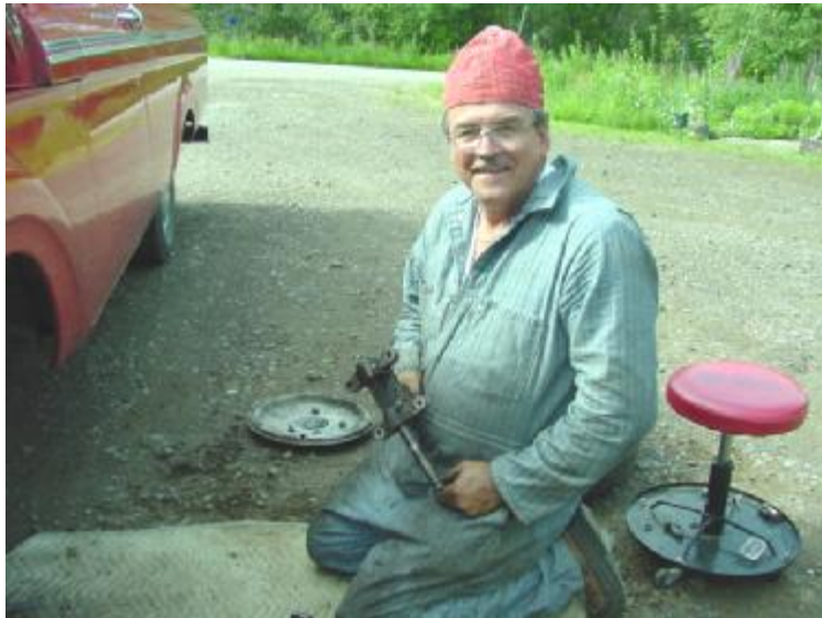
Replacing worn King Pins is hard work!

In order to at least make it a driver I overhauled the three speed tranny myself. Next the cab was stripped and floors and column were repaired.