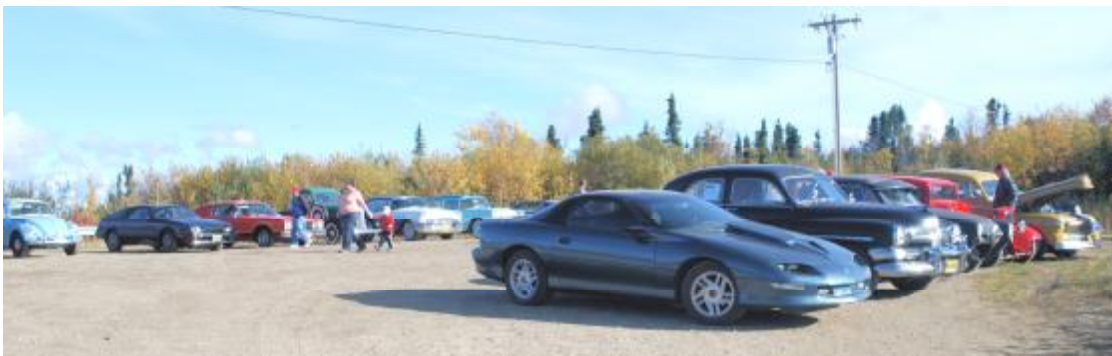
Some of the cars parked at Cleary Summit—the 3rd Stop (4th Card Draw) on the Drive