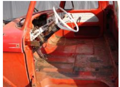
Cab is stripped

I reupholstered the seat myself. Next the king pins were replaced to keep it from