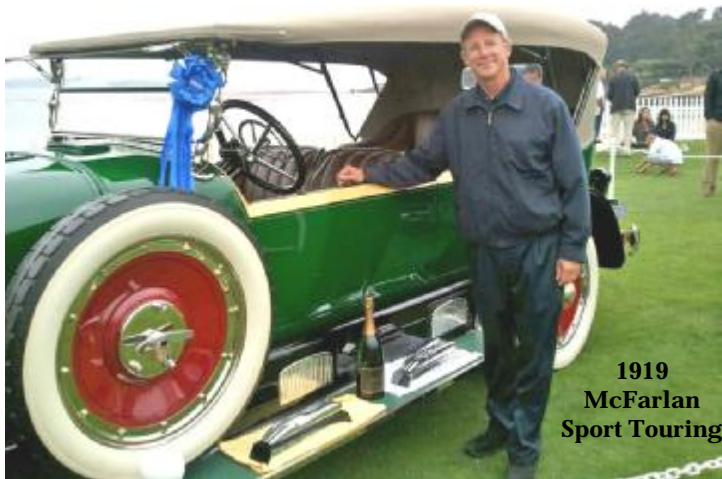
1919 McFarlan Sport Touring