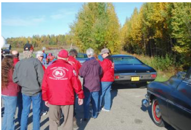
Card Draw at the Pipeline View Station—1st Stop