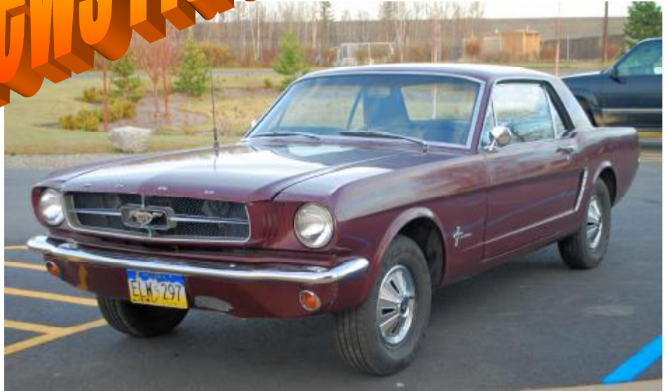
On Tuesday, Sept 25th, the Raffle Car Committee purchased this 1965 Mustang for our 2013 Raffle. Watch for more news on the car, the work that needs done on it, and the what when and where of Ticket Sales.