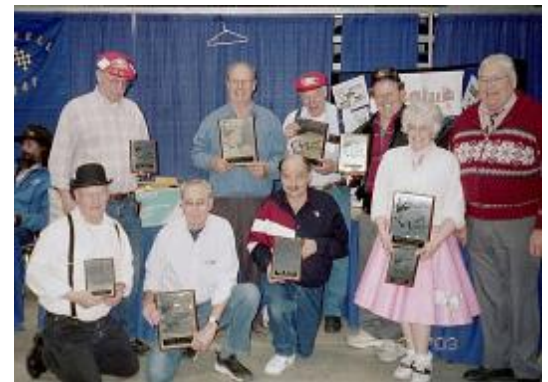
2003: First of the current Carlson Center Show Winners.