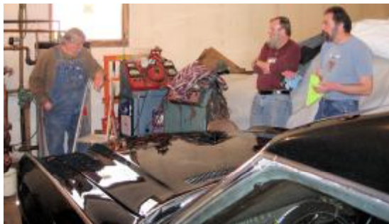
FINAL CONFERENCE—and the judgement that "it is ready for the show"...

Hello Everyone: We had another good work day with six people showing up. We were able to finish all the items on our task list (polishing bumpers and side trim, installed rear view mirror, installed speakers and grills, cleaned the windows, applied a soft coat of wax and vacuumed). We ended the day declaring victory since no more work sessions will be required. The very few detailing items that remain (e.g. shine the tires) can be handled by an individual or two when they take the car to club events and other venues. The car still needs the following items: chrome lock pulls for both doors, rim with spare tire, jack, lug wrench and under-hood vent intake cover. If anyone in the club has any of those items we would appreciate a donation. Cheers, Terry Whittlege