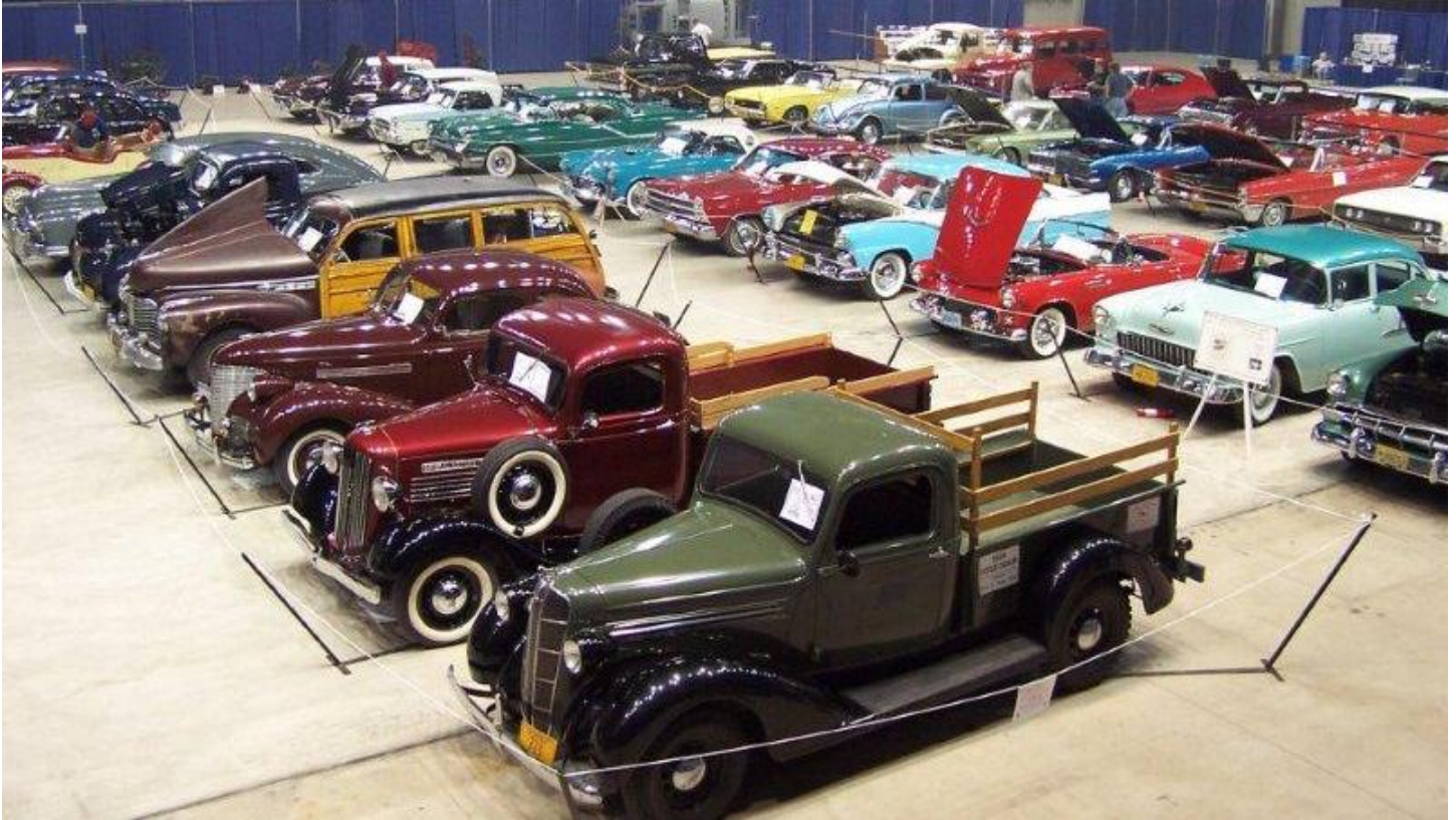
The Second Carlson Center Show (2004) - Every year grows and changes—get your car registered NOW!

The Carlson Center Members Only Show is this month —but the club has a long history of car displays and shows.