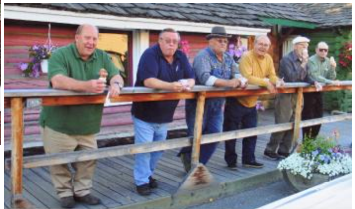
Ice Cream Cronies at Pioneer Park in 2006