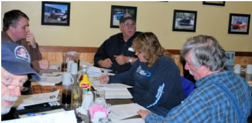
Board Meetings are open to all who wish to participate. Here are the bored at our March 6th Meeting. Note the pictures on the wall at Sam's Sourdough...